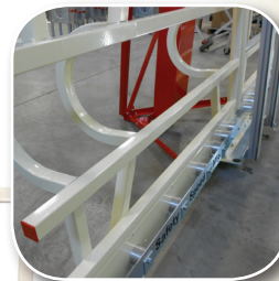
Frame Designed to Integrate Automated Stops