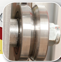
Dual V-track &amp; Bearing