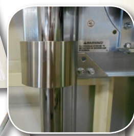
Double Bearings with Cover