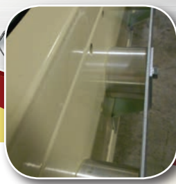
Aluminum Rollers vs. Plastic