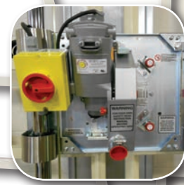
Worm Drive Motor